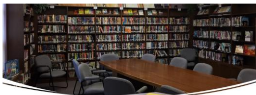
The Resource Team is purging the Library