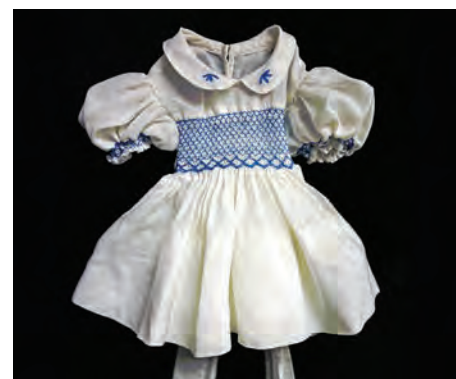
From 1985, the year Beginnings received our adoption license.

If you would like more information on how to make a donation in honour or in memory of a loved one, please give the office a call.